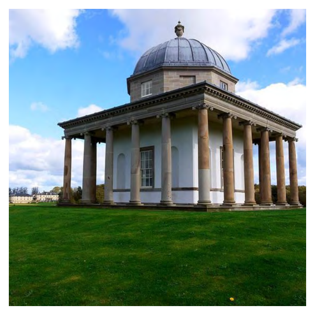
Hardwick Park - Temple of Minerva

As this initial Corporate Asset Management Plan is a first stage document, each of the three elements will be subject to review over the next 2 years to ensure they continue to meet and support corporate ambitions and priorities. In particular, the Asset Management Action Plan will be used as a live tool to direct and reflect asset management programmes of work undertaken and will be actively managed and amended as required.