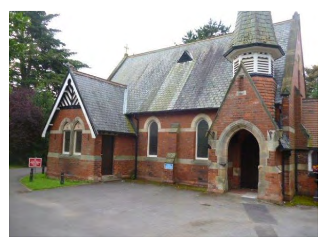
Ropery Lane Cemetery