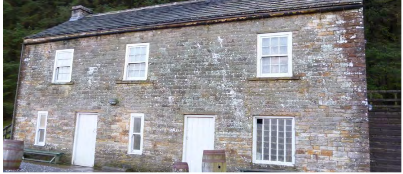
Killhope Lead Mining Centre - Lead Mining Shop and Store