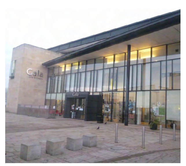
Durham Gala Theatre