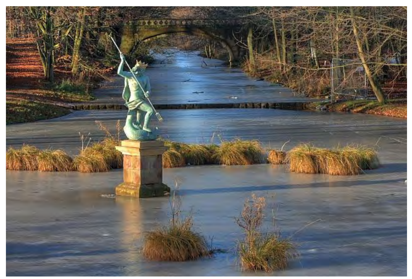
Hardwick Park - Statue of Neptune

Our work in the coming year will ensure that we have quality data, policies and procedures to drive improvement and have a property portfolio that we are proud of. The full Corporate Asset Management Plan 2025 will develop the current position and provide a longer term vision.