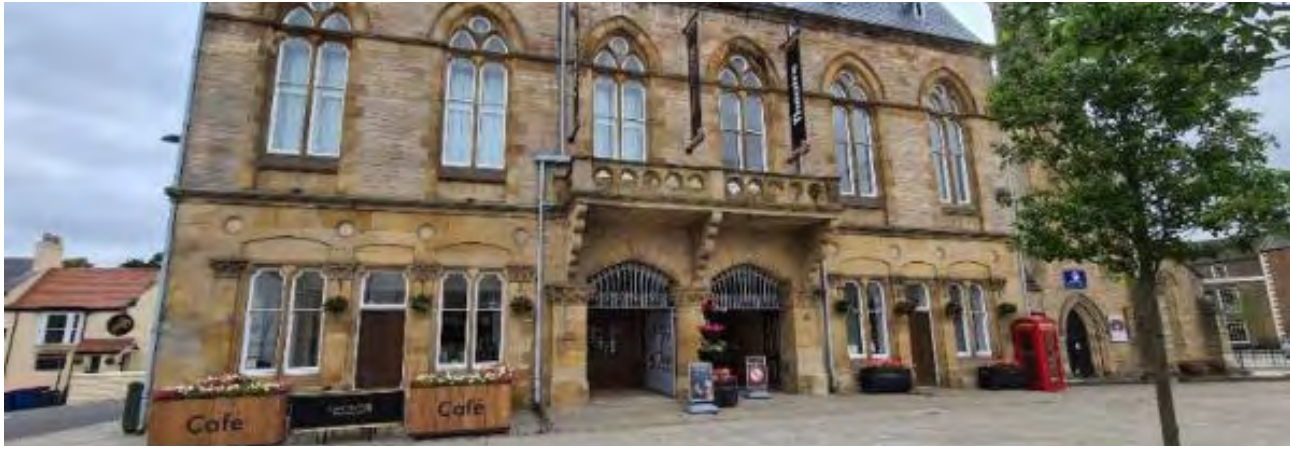
Bishop Auckland Town Hall