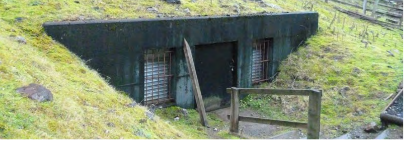
Killhope Lead Mining Underground Installation

Implementation of the Corporate Asset Management Plan will be led by the Corporate Director for Regeneration, Economy and Growth reporting through the Corporate Property Board. Governance arrangements are set out in more detail within Part 2 (the Asset Management Policy).