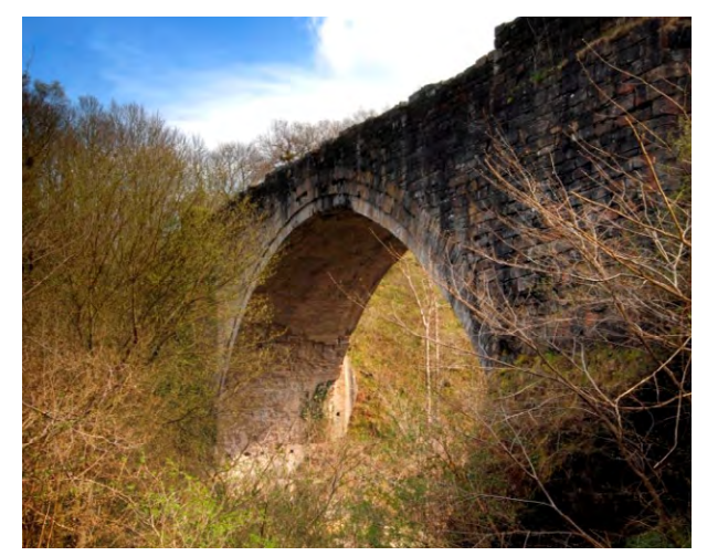
Tanfield Causey Arch