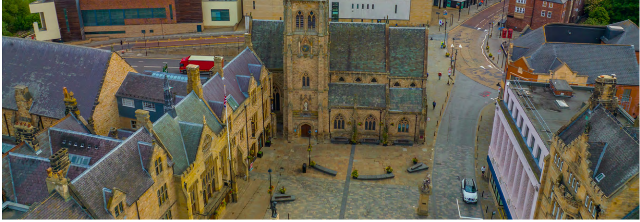
Durham Town Hall