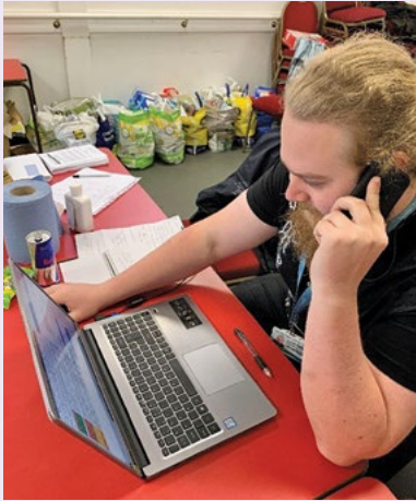
PACT House Volunteer