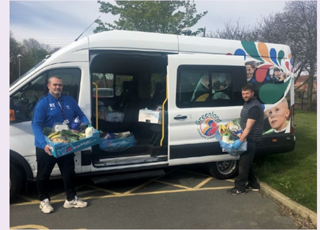
Staff delivering Food Hampers to Venerable Families