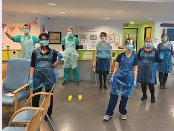
Staff at the local Medical Centre wearing the visors