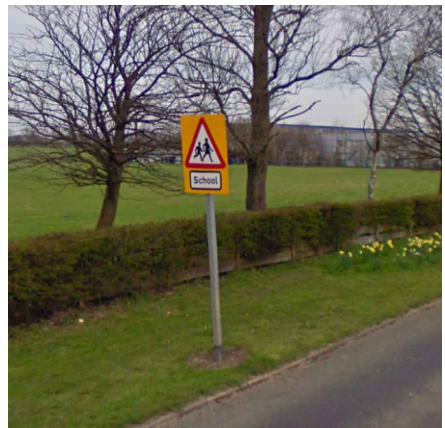
Take down and dispose of existing sign assembly and Install new sign assembly as shown on 4230mm x 89mmØ power post in grass verge ducting required to L/C. As per sign schedule 1.