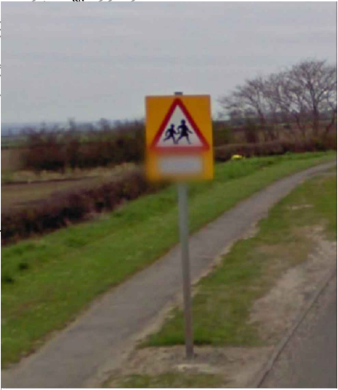
Take down and dispose of existing sign assembly and Install new sign assembly as shown on 4230mm x 89mmØ power post in grass verge ducting required to L/C. As per sign schedule 1.